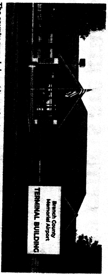
The county owned airport leases land around the runways for farming to keep down maintenance cost.